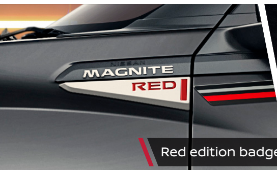
Red edition badge