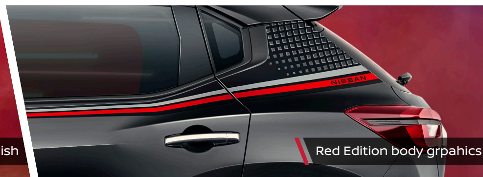
Red Edition body graphics