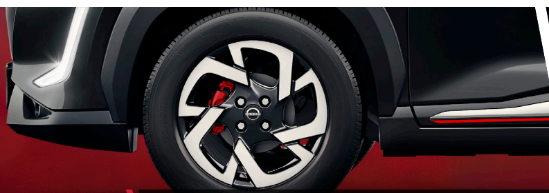
R16 alloy wheel with sporty red brake calliper