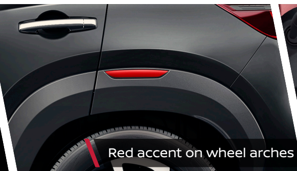
Red accent on wheel arches