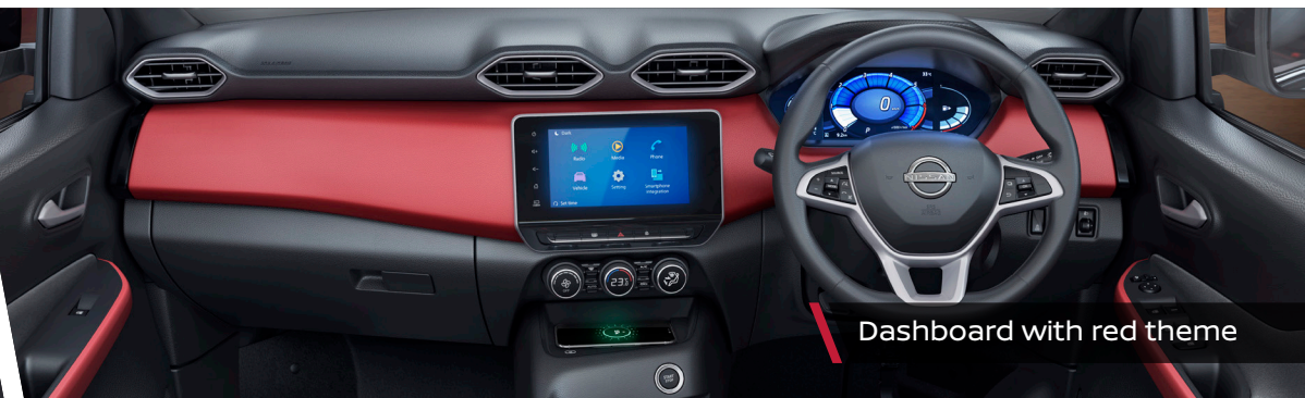
Dashboard with red theme