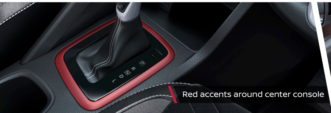
Red accents around center console

The red highlights in the interior of the Magnite Red manifest your passion for adventure and thrill. Whether it's the red inserts or the dashboard, the ambient mood-lighting or the central red theme, everything is carefully crafted to let you ignite your mission.