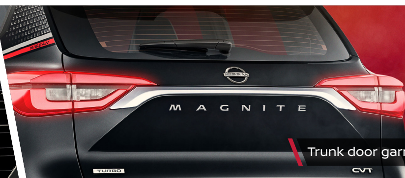
Trunk door garnish