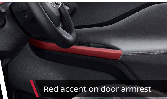
Red accent on door armrest