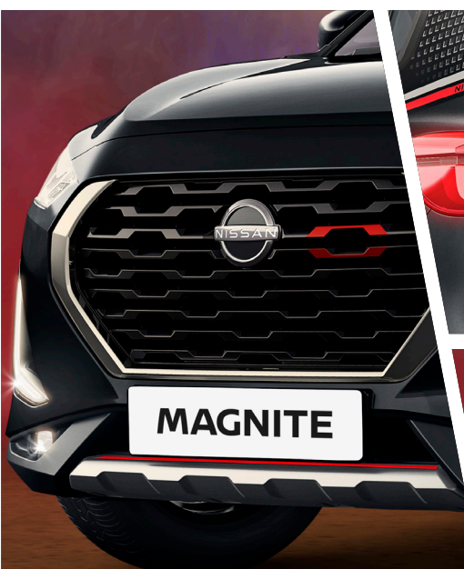
RED accent on front grille & front bumper cladding