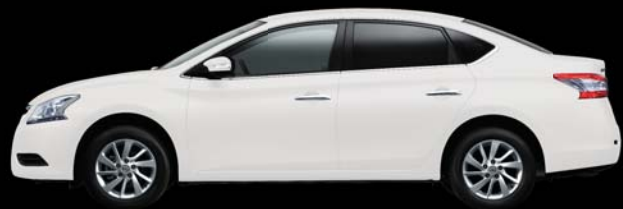
White (S) QM1