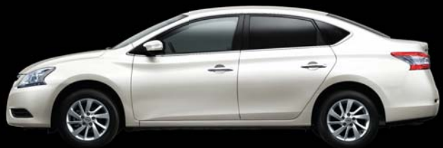
Pearl White (M) QX1