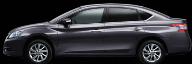
Dark Gray (M) KBD