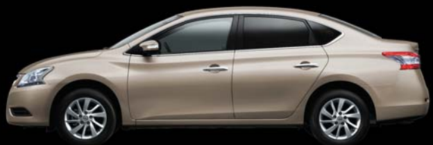
Brownish Gray (M) KAC