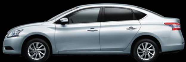
Silver (M) K23