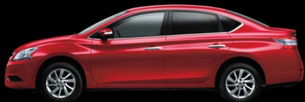
Red (M) NAH